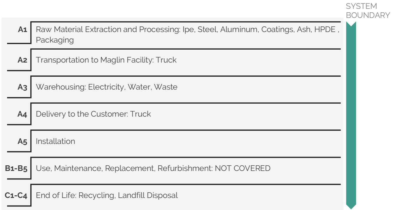
Figure 2: Process Flow Diagram for processes covered in this study

According to the PCR, the following figure illustrates the general activities and input requirements for producing waste receptacles products and is not necessarily exhaustive.