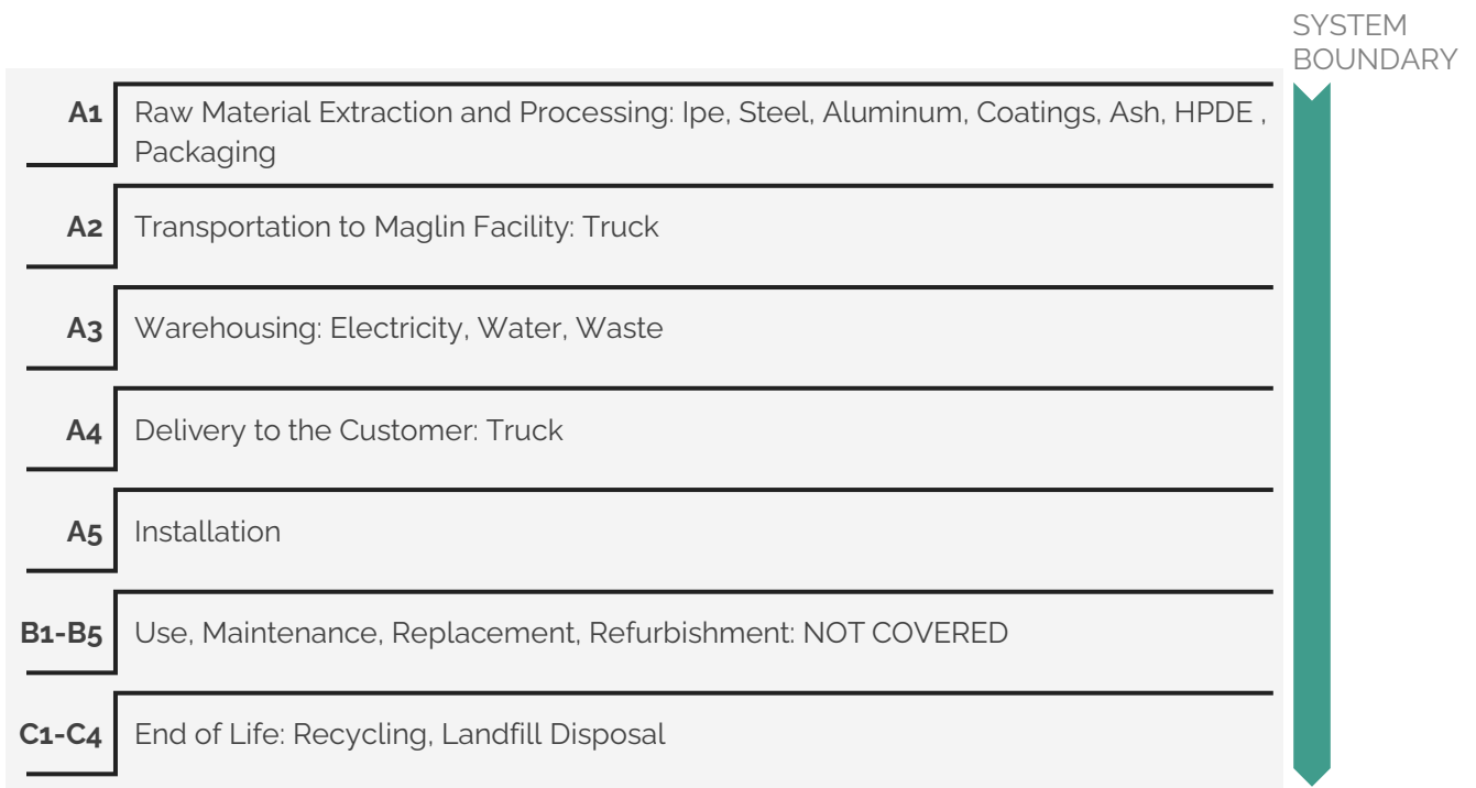
Figure 2: Process Flow Diagram for processes covered in this study

In addition, as according to the relevant PCR, the following requirements are excluded from this study: